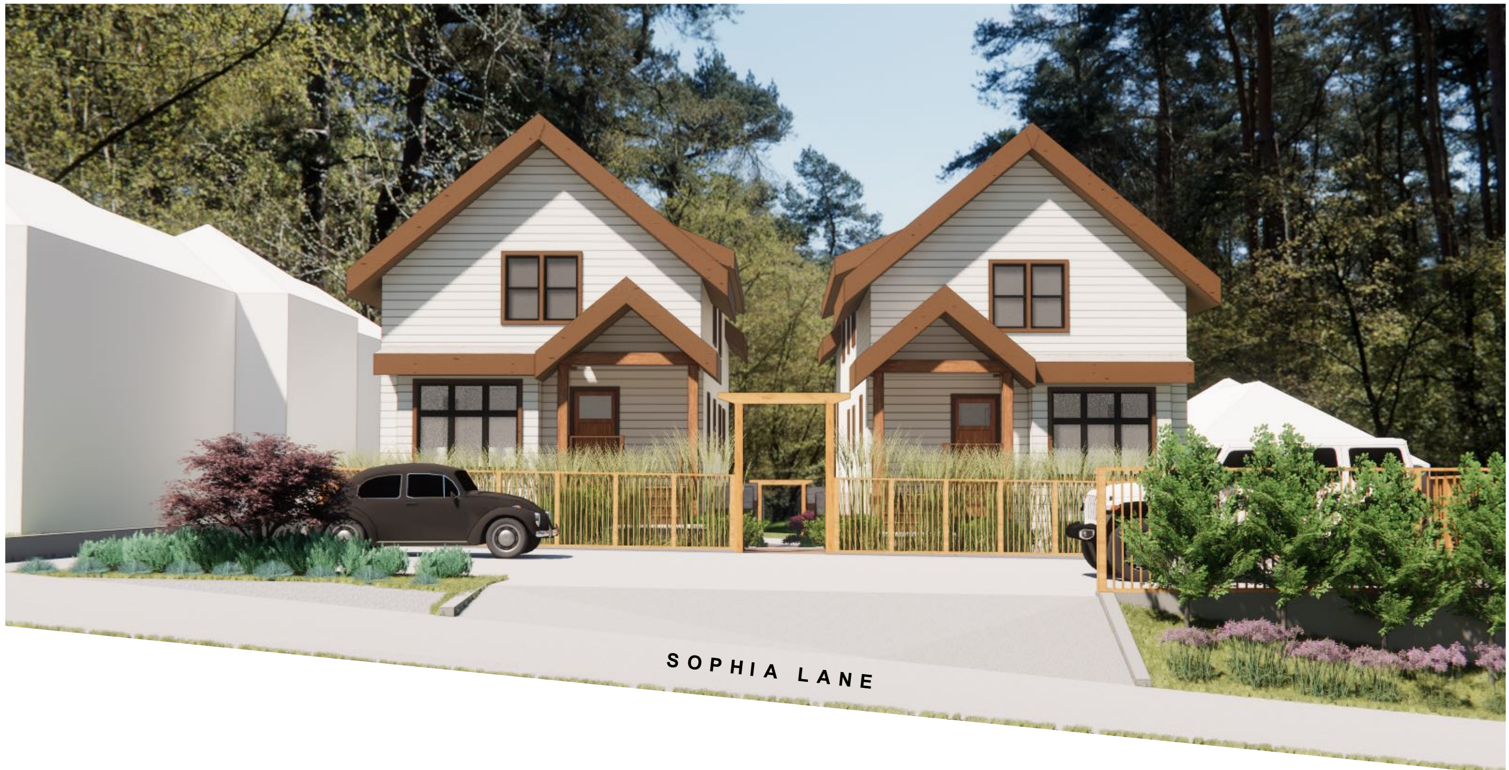
2 View 2