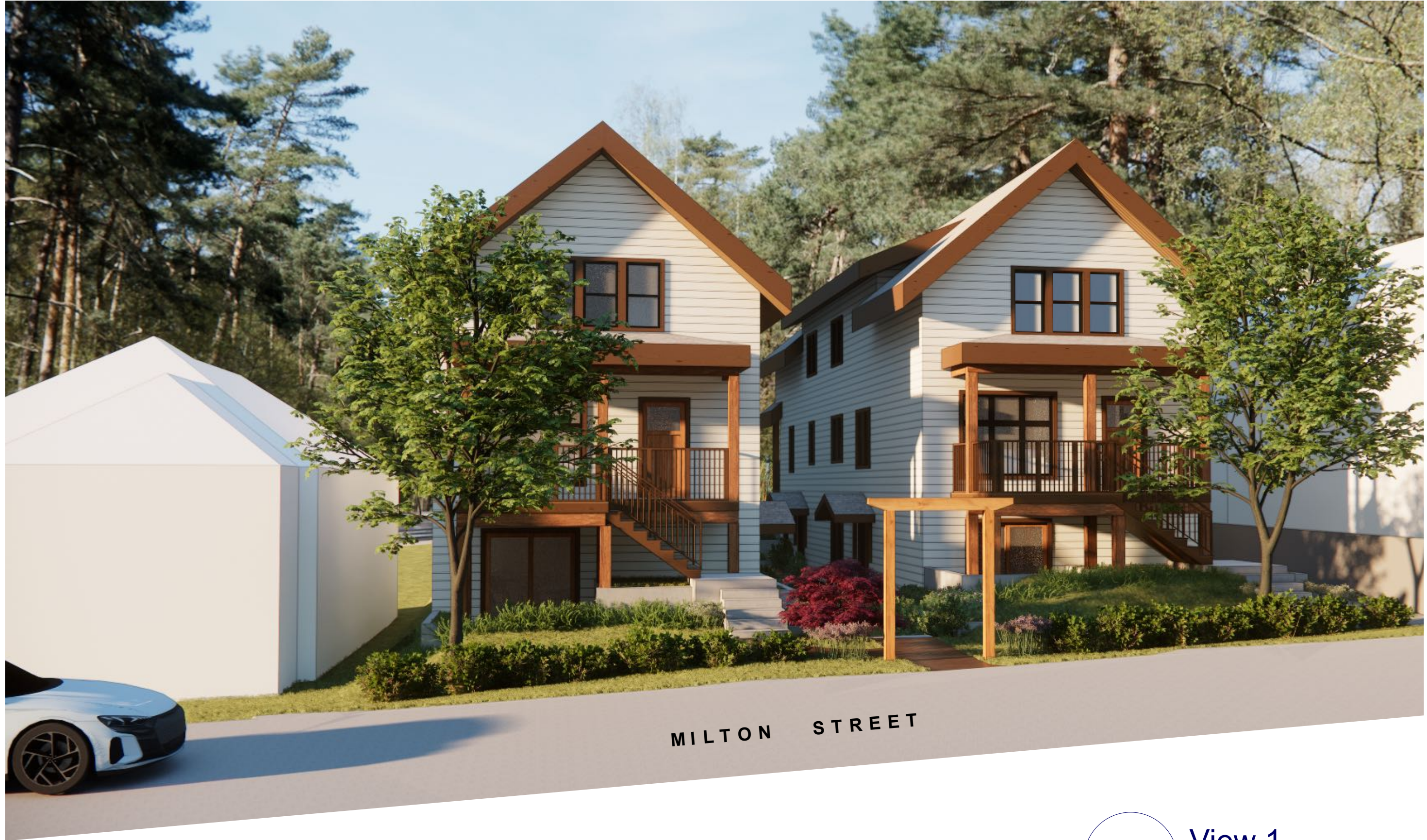
1 View 1