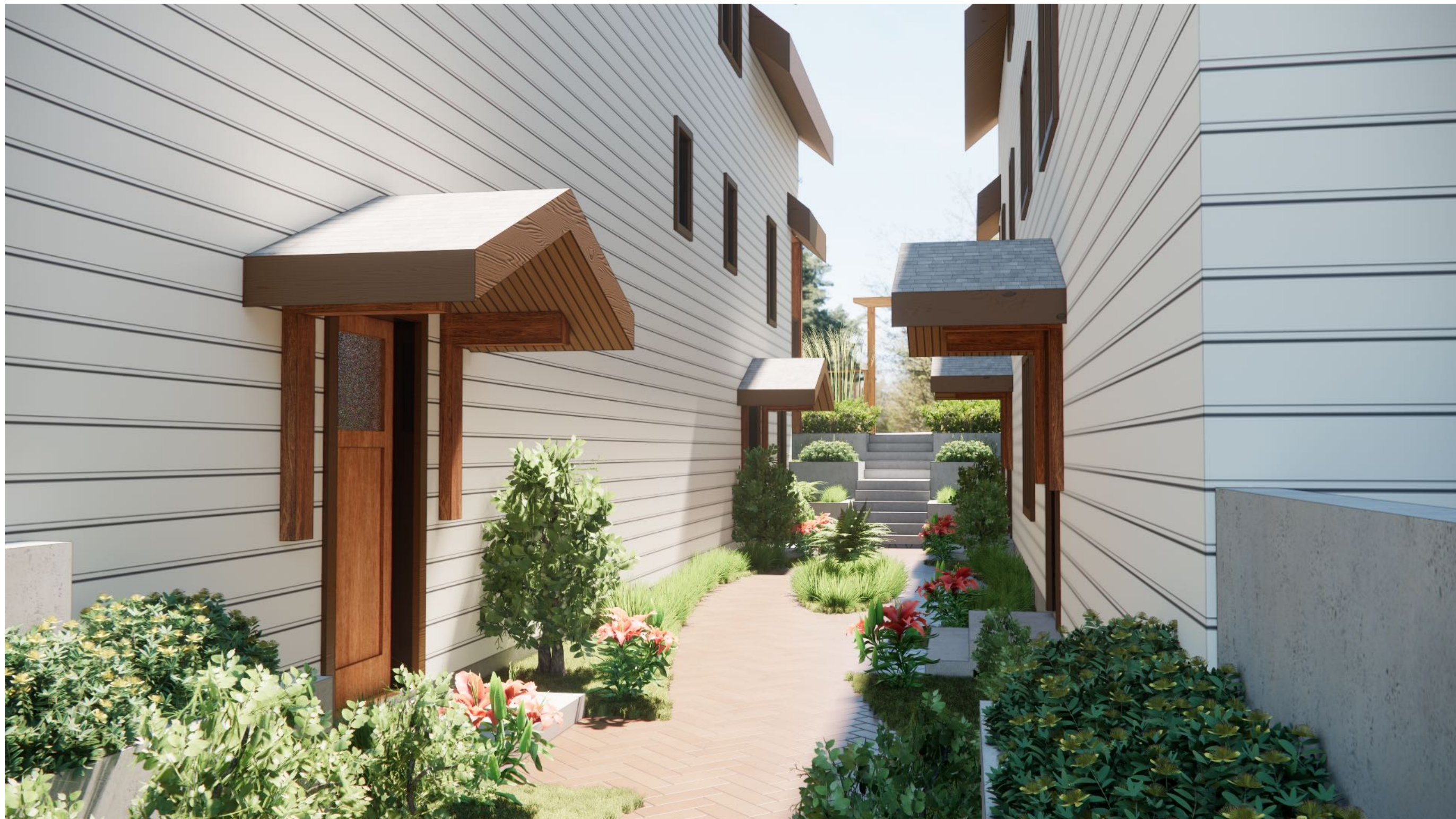
4 View 3